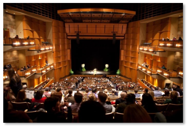
Above photo by Max Whitaker