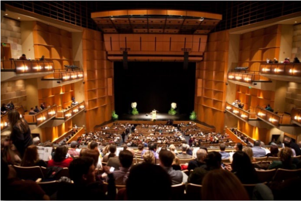
Above photo by Max Whitaker