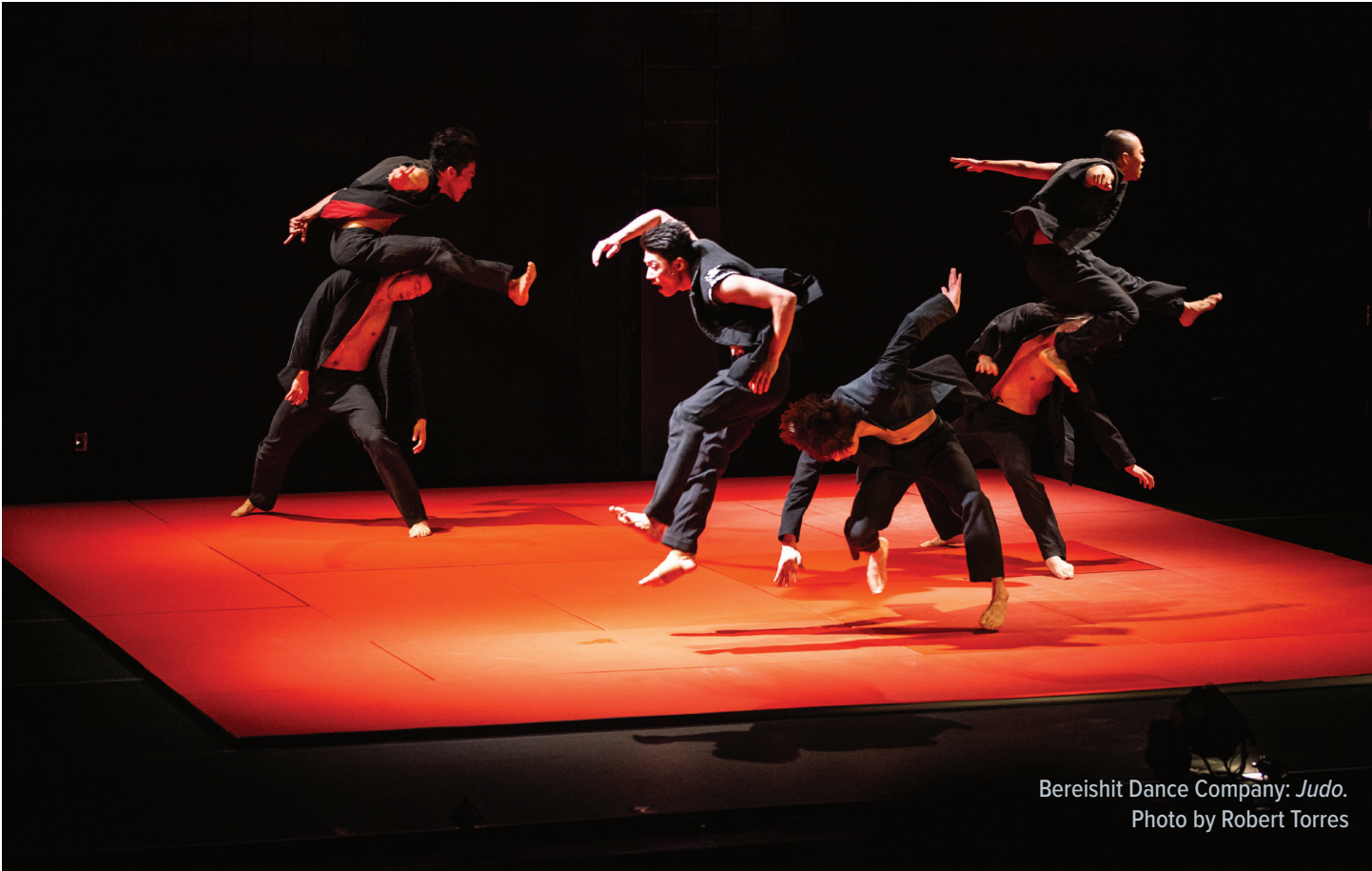
Bereishit Dance Company: Judo.