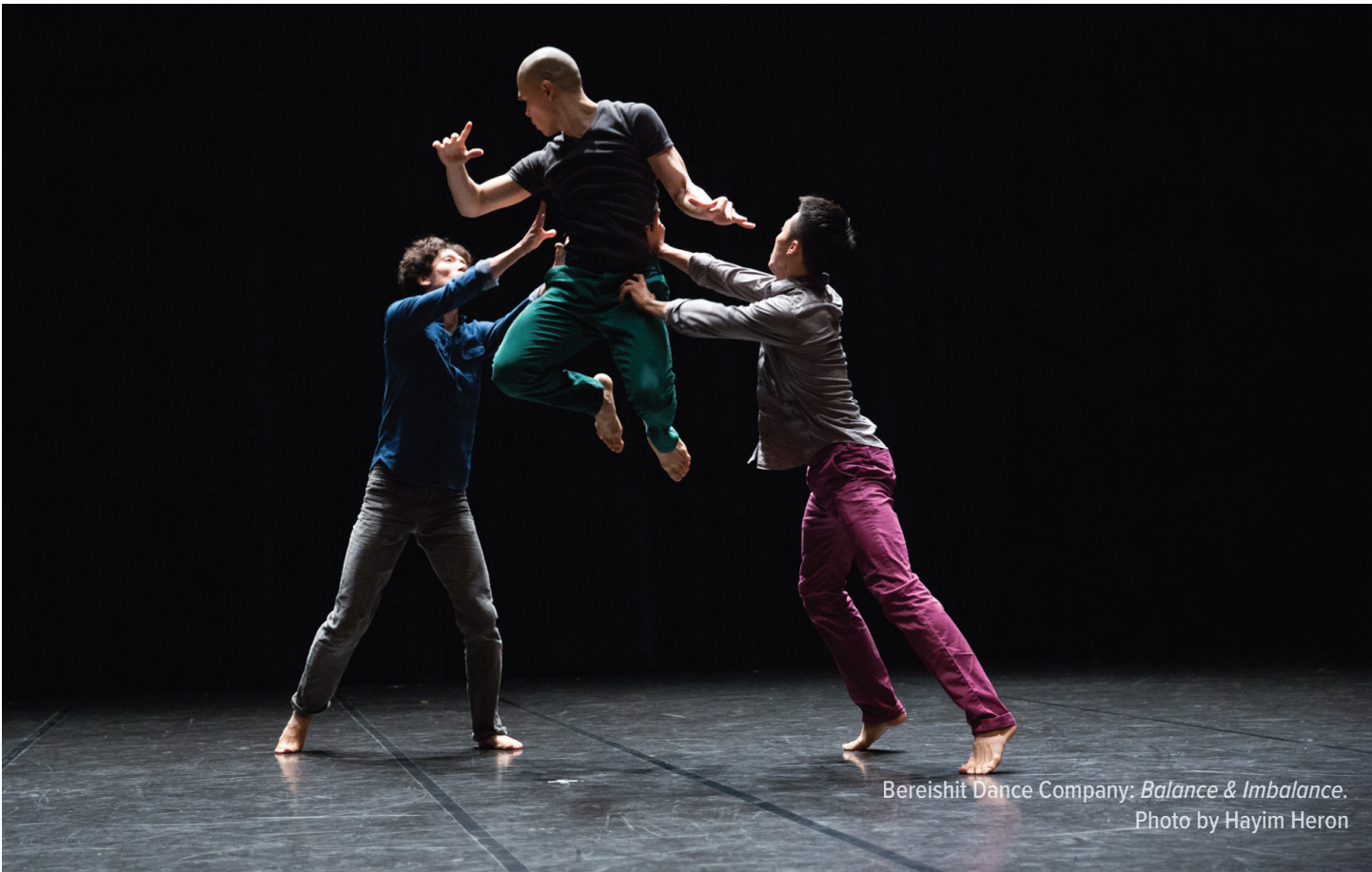
Bereishit Dance Company: Balance & Imbalance.